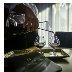
Two Doors Down Restaurant and Bar